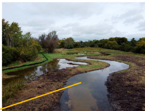
Post flood, and after artesian aquifer was unearthed.