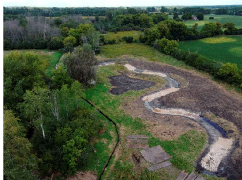
Mason Creek Sept 10 th