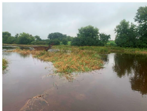
Mason Creek Flooded Sept 12 th